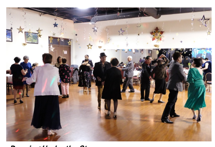
Dancing Under the Stars