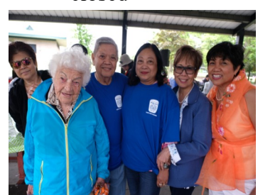
Former Mississauga Mayor Hazel McCallion at Kalayaan Picnic

and/or elected in abstentia, provided a written acceptance of the nomination by nomnee/candidate is received by COMELEC before nomination for the position is closed