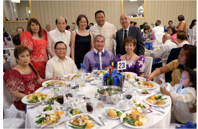
KFCO's Gala Night 2018