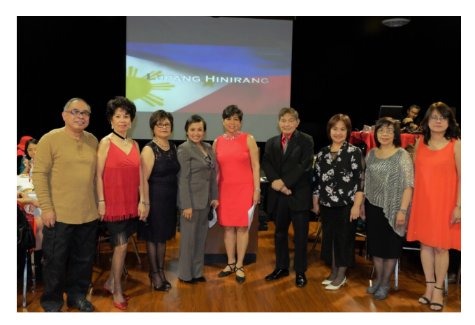
KFCO Executive Council Members